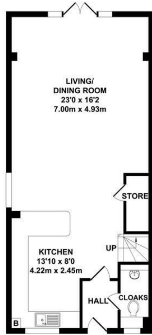
GROUND FLOOR APPROX. FLOOR AREA 594 SQ.FT. (55.23 SQ.M.)